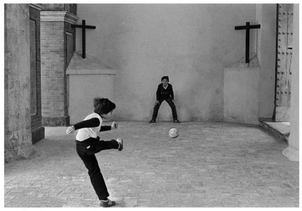
Siviglia, Spagna, 1984